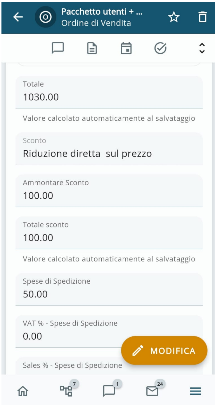
Sales Order Total, Taxes, Shipping & Handling Charges, Discounts and Rounding off